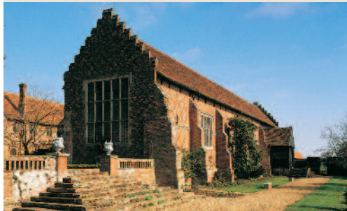
Above The Long Gallery is perfect for trade shows as well as buffets and banquets.