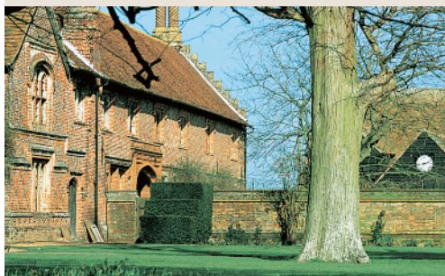
Above Individual rooms may be used for board meetings, training and interviews.